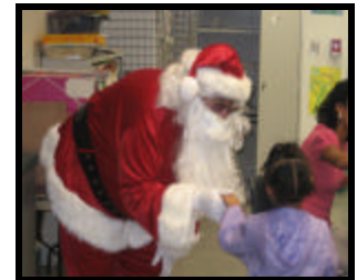
This young girl was in shock when she saw Santa walk in the door!

*This event was made possible by the generous donations of