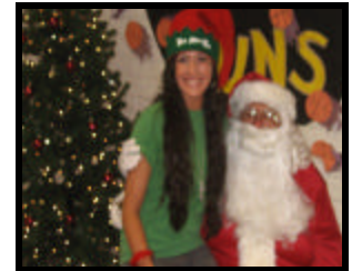
Santa and his elf